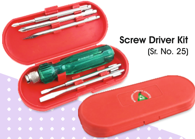
Screw Driver Kit (Sr. No. 25)

(For rates and description refer to accompanying catalogue and order form)