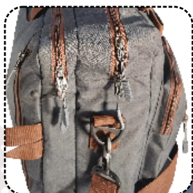
Multifunctional Travel Bag (Sr. No. 08)