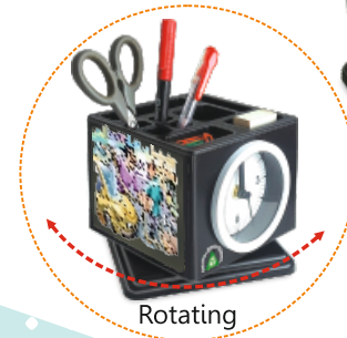
Table Top with Clock (Sr. No. 26)