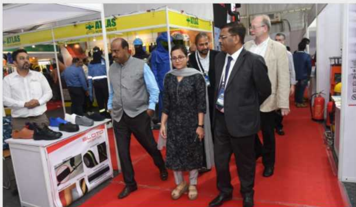
A view of Exhibition stalls