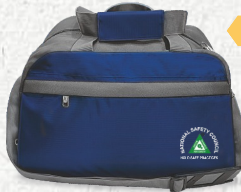
Duffle Bag ( Sr. No. 12 )