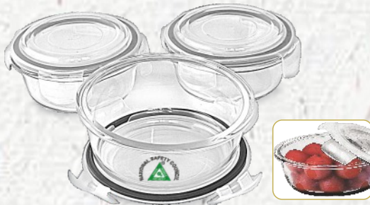
Bliss Round Glass Container Set of 3 ( Sr. No. 13 )

Photo Catalogue of Utility Articles (For rates and description refer to accompanying catalogue)