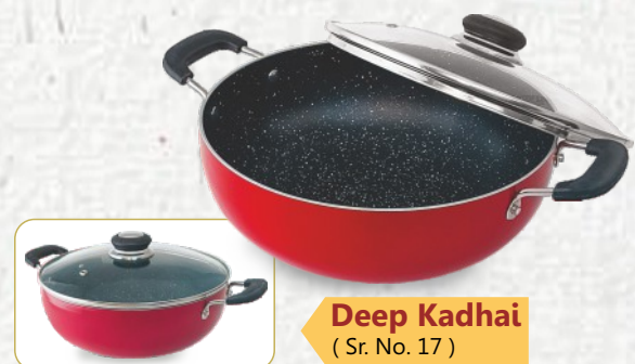
Deep Kadhai ( Sr. No. 17 )