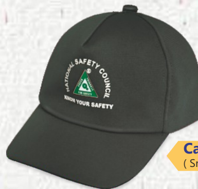
Cap ( Sr. No. 7 )