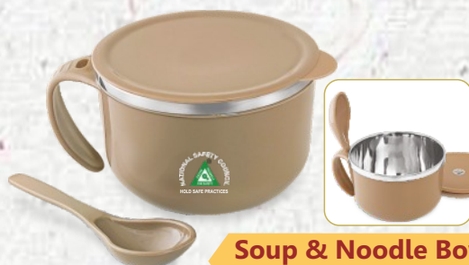
Soup & Noodle Bowl ( Sr. No. 14 )