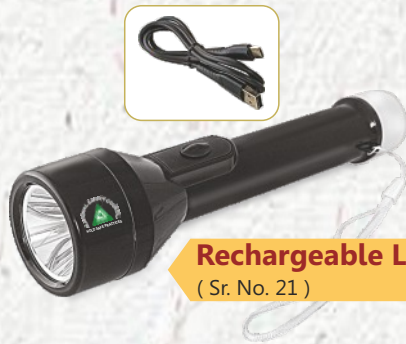
Rechargeable LED Torch ( Sr. No. 21 )

Photo Catalogue of Utility Articles (For rates and description refer to accompanying catalogue)