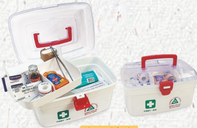
First Aid Kit ( Sr. No. 10 )