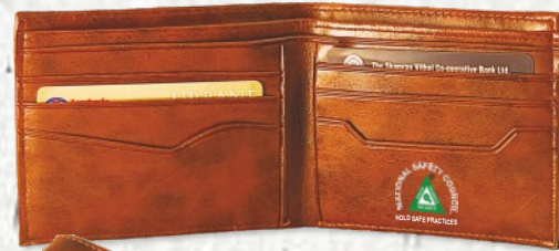
Executive Wallet (Brown) ( Sr. No. 6 )