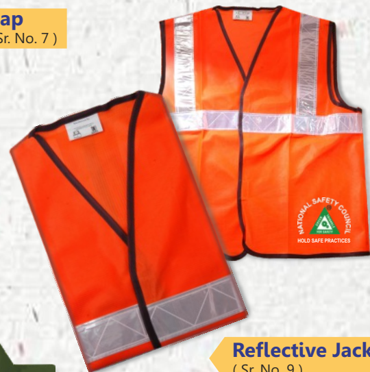
Reflective Jacket ( Sr. No. 9 )