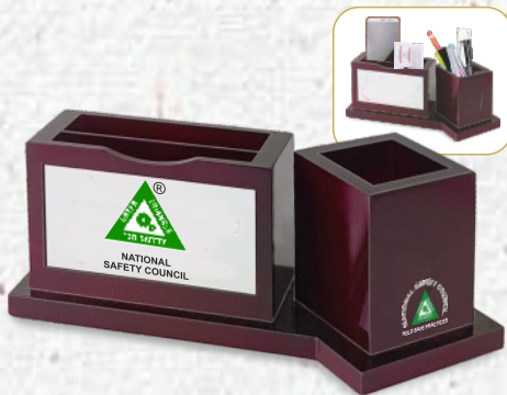
Wooden Desk Organizer ( Sr. No. 23 )