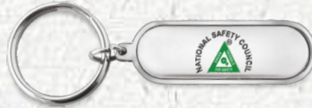
Metal Key Chain ( Sr. No. 4 )

Photo Catalogue of Utility Articles (For rates and description refer to accompanying catalogue)