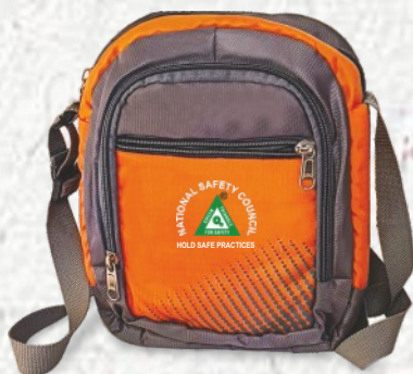
Shoulder Sling Bag ( Sr. No. 26 )