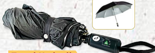
Travel Umbrella ( Sr. No. 28 )