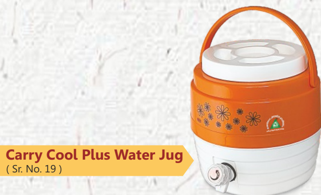
Carry Cool Plus Water Jug ( Sr. No. 19 )