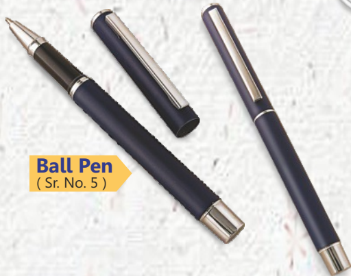
Ball Pen ( Sr. No. 5 )