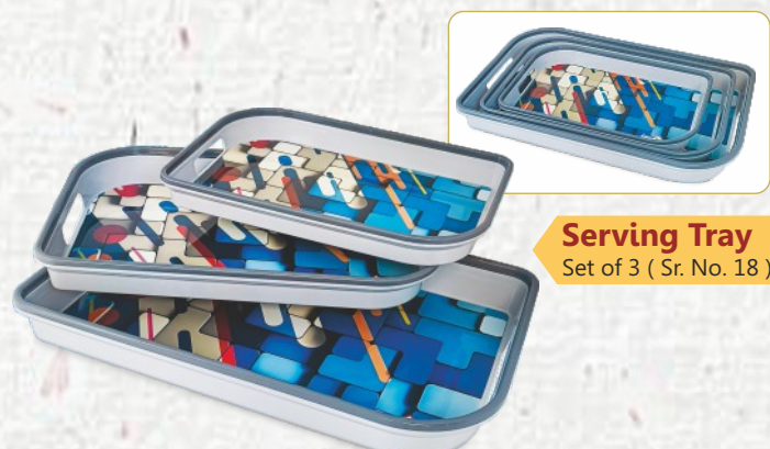
Serving Tray Set of 3 ( Sr. No. 18 )

Note : Numbers mentioned in the bracket indicates serial number of the item in the accompanying catalogue. The colours of the utility articles may vary from the Photo Catalogue depending on the availability of raw materials.