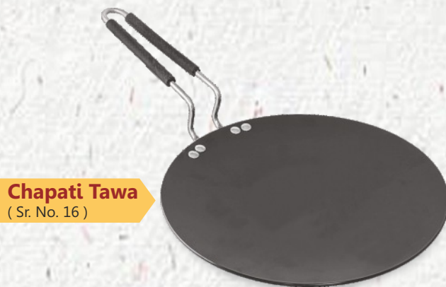
Chapati Tawa ( Sr. No. 16 )