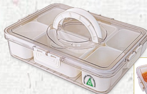
Snapit Multipurpose Box ( Sr. No. 15 )