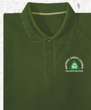
Polo Collar T-Shirt ( Sr. No. 11 )

Note : Numbers mentioned in the bracket indicates serial number of the item in the accompanying catalogue. The colours of the utility articles may vary from the Photo Catalogue depending on the availability of raw materials.