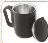
Steel Mug with Lid ( Sr. No. 27 )