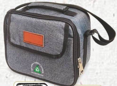
Lunch Pack ( Sr. No. 24 )