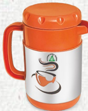
Thermal Flask ( Sr. No. 22 )