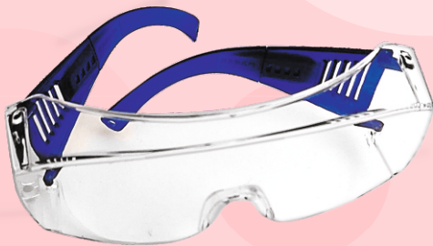
Safety Eyewear (Spectacles) Sl. No.5