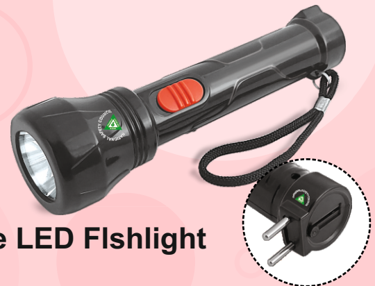
Rechargeable LED Flashlight Sl. No.9