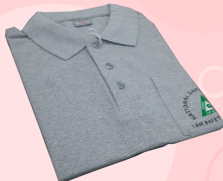
Polo Collar T-Shirt Sl. No.10

Note : Numbers mentioned in the bracket indicates serial number of the item in the accompanying catalogue. The colours of the utility articles may vary from the Photo Catalogue depending on the availability of raw materials.