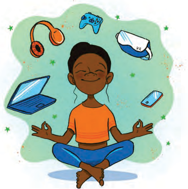
( https://swgfl.org.uk/topics/digital-wellbeing/ )

World Health Organisation has defined health as physical, mental and social wellbeing and not merely an absence of disease and deformity. In today's scenario, our wellbeing has four important aspects; physical, mental, emotional and social wellbeing.