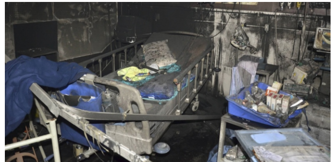
Charred remains of the ICU at Uday Shivanand Hospital in Rajkot, Gujarat.

5) On 27 th November, 2020, a massive fire broke out at the ICU ward of Uday Shivanand Hospital, Rajkot, Rajasthan, which resulted in the death of 6 COVID-19 patients (See Fig. 10). A short-circuit in one of the ventilators is suspected to have triggered the fire, which spread so fast that the Mavdi Fire Brigade, which is barely 300 meters from the hospital, could not save their lives. There were four staff in the ward, including a doctor, but they could not use the fire extinguishers, despite being trained to, because the blaze spread so rapidly.