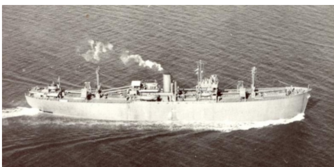
SS Fort Stikine at the deep seas before it exploded in the Victoria Dock, Bombay.

The selected fire incidents that occurred in major hospitals in India from 2010 to 2021 were compiled and presented below. During this period 61 incidents were reported, which are divided into 2 groups. The group 1 provides the details of 35 fire incidents reported during the period 2010 – 2019.