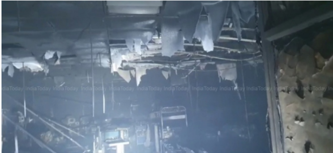
Remains of the ICU ward of Vijay Vallabh Hospital, Virar, Maharashtra.

13) On 23 rd April, 2021, a massive fire occurred in the ICU ward of Vijay Vallabh Hospital, Virar, Maharashtra, which resulted in the death of 13 COVID-19 patients ( See Fig. 17 ). There were 17 patients in the ICU for Covid-19 treatment when the fire took place. A blast in the Air Conditioner Unit, resulted in the fire.