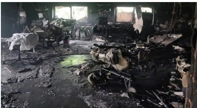
Charred remains of the ICU at Shrey Hospital in Ahmedabad, Gujarat.

2) On 15 th August, 2020, a major fire broke out in the ICU ward of Shrey Hospital, Ahmedabad, Gujarat, resulting the death of 8 COVID-19 patients (See Fig. 09). Due to this fire, 41 patients were shifted to nearby hospitals. The cause of the fire was attributed to electrical short-circuit.