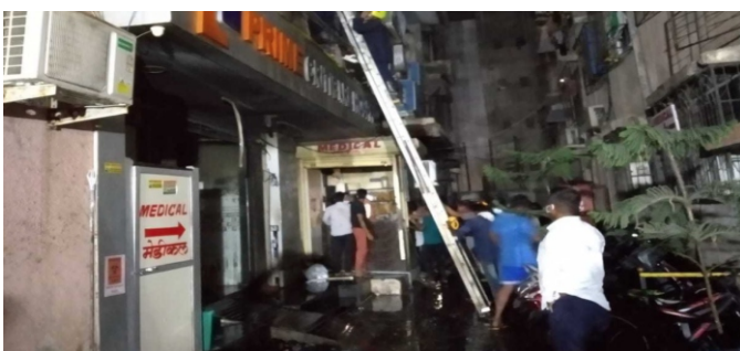
A major fire occurred in Prime Criticare Hospital, Thane.

15) On 28 th April, 2021, a major fire occurred in Prime Criti care Hospital, Thane, Maharashtra, in which 4 patients died ( See Fig. 19 ). At least 20 patients were undergoing treatment in the hospital when the blaze was triggered. The officials got into action to shift the patients to nearby hospitals, however, four patients succumbed while in transit. An electrical short-circuit occurred in the meter room initiated the fire.