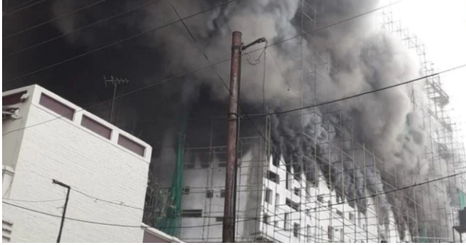
Massive fire on Under Construction Hospital in Nagpur, Maharashtra.

9) On 07 th February, 2019, a major fire broke out at Metro Hospital and Heart Institute, Sector-12, in Noida ( See Fig 07 ). The fire occurred at the Second Floor ICU of the of the Hospital which was caused due to a short-circuit of the water heater inside the recovery area. Thick smoke was billowing out of the building as staffers tried to evacuate the patients. Many people were trying to jump out of windows. People were standing on ledges in balconies as rescuers tried to reach them by breaking window panes. A few others were seen slithering down the building using ropes. All the patients were successfully rescued and evacuated to the Hospital's Sector-11 branch.