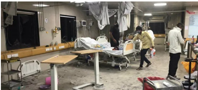
Remains of the ICU of Ayush Hospital, Surat.

14) On 25 th April, 2021, a major fire occurred in the ICU ward of Ayush Hospital, Surat, Gujarat, which resulted in the death of 4 patients ( See Fig. 18 ). At the time of fire there were 15 patients in the ICU. Out of the 15 patients, 4 were in the ventilator. All the 15 patients were shifted to nearby hospitals and 4 patients died while shifting. The cause of the fire was electrical short-circuit which happened due to a blast in the Air Conditioner Unit.