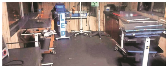
Massive fire broke out at Civil General Hospital, Bhandara, Maharashtra.

6) On 9 th January, 2021, a massive fire broke out at Civil General Hospital, Bhandara, Maharashtra, in which 10 newborn babies died (See Fig. 11). Seven other infants who were admitted in the unit were however rescued. The cause of the fire was attributed to electrical shortcircuit.