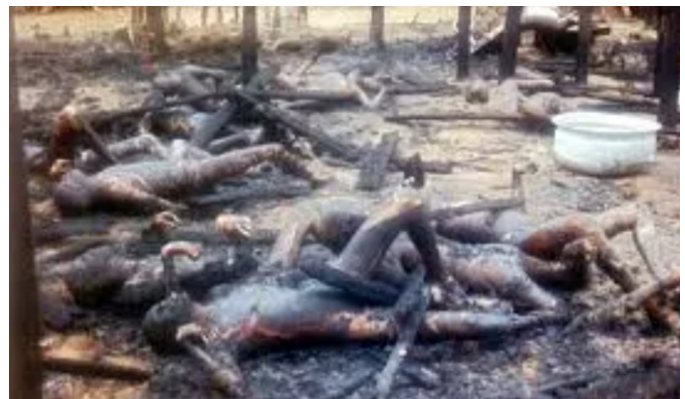
Burnt bodies of the inmates at the Moideen Badusha Mental Home in Erwadi Village in Tamil Nadu.

Before proceeding to the details of the fire incidents reported from 2010 to 2021, let us remember the gruesome fire incident that occurred on 6 th August, 2001, at Moideen Badusha Mental Home in Erwadi Village in Tamil Nadu ( See Fig 02 ), where 28 inmates of a faith-based mental asylum died in the fire. The inmates were unable to escape as they were bound by chains to trees and beds. The origins of the fire are unknown, but once it spread, there was little hope of saving most of the 45 inmates, who were chained to their beds in the ramshackle shelter in which they slept, though such shackling was against the Indian law. Some inmates whose shackles were not as tight escaped, and five people were hospitalized for severe burns. The bodies of the dead were not identifiable.