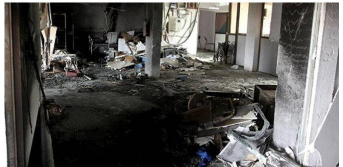
Remains of the ICU of The Patel Welfare Hospital in Bharuch.

16) On 1 st May, 2021, a massive fire broke out in the ICU of Patel Welfare Hospital in Bharuch, Gujarat, in which 16 COVID-19 patients and 2 nurses were killed ( See Fig. 20 ). At the time of fire, there were 57 Covid-19 patients in the hospital, including 23 in the general ward and 12 each in two ICUs. Forty-one patients were shifted to various hospitals in Bharuch and nearby towns. The fire was so intense that the ICU ward was almost burnt to the ground. All the equipment inside, including the ventilators and the fridge used to store the medicines and also the beds, were turned to ashes. The exact cause of the fire is yet to be ascertained. However, the fire department officials suspect a leak in an oxygen cylinder may have led to the fire.