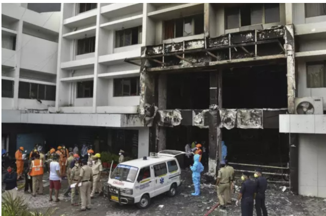
Rescuers and others stand outside Hotel Swarna Palace, Vijayawada, A.P.

1) On 9 th August, 2020, a massive fire engulfed the COVID-19 isolation facility created at the Swarna Palace Hotel, Vijayawada, Andhra Pradesh (See Fig. 08). The fire initially started on the ground and first floor. When fire spread thick smoke filled the rooms. The exact cause of the fire was not known yet. However, it resulted in the death of 11 COVID-19 patients and injury to 22 patients.