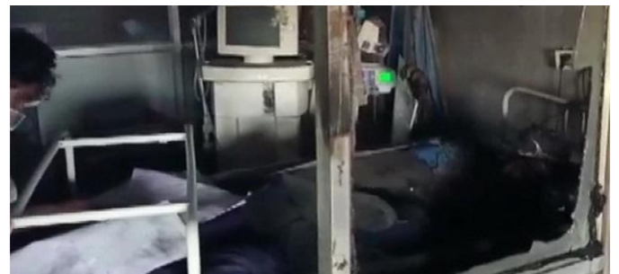
Charred remains of the COVID-19 ward of Rajdhani Speciality Hospital, Raipur, Rajasthan.

12) On 18 th April, 2021, a massive fire occurred in the COVID-19 ward of Rajdhani Speciality Hospital, Raipur, Chhattisgarh, which had taken the life of 5 COVID-19 patients (See Fig. 16). Out of the 5 patients died, one was charred to death and 4 others died due to suffocation. A team of the police and fire fighting personnel rushed to the spot and 29 patients were evacuated from the hospital. According to officials, the fire was caused by a short-circuit in one of the fans and eventually spread to the Covid-19 ward.