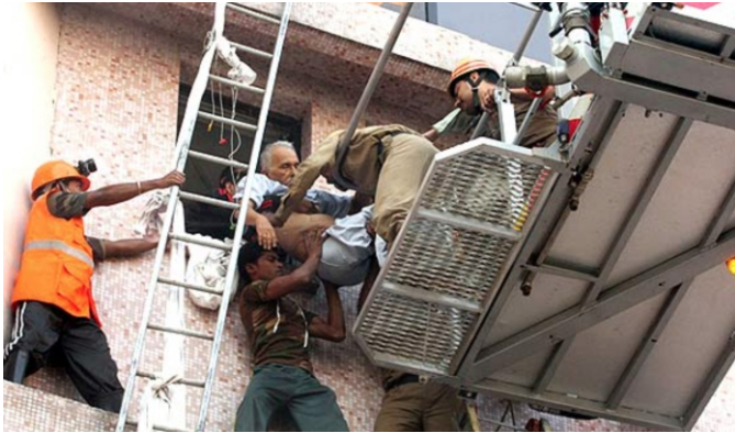
Rescue work undergoing at AMRI Hospital, Kolkata.

20 th December, 2011. On 30 th December 2013, the hospital unit was reopened partially, which it became fully operational by 5 th July 2014.