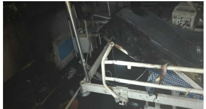
Charred remains of the hospital beds at Well Treat Hospital, Nagpur.

11) On 10 th April, 2021, a major fire broke out in the COVID-19 ward of Well Treat Hospital, Nagpur, Maharashtra, in which 4 COVID-19 patients died (See Fig. 15). The fire was caused due to electrical short-circuit in an Air Conditioner Unit.