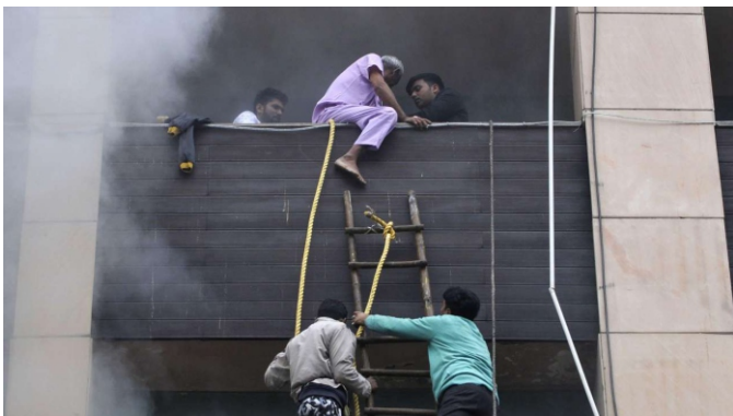
A man is being rescued at Metro Hospital in Noida, U.P.

9) On 07 th February, 2019, a major fire broke out at Metro Hospital and Heart Institute, Sector-12, in Noida ( See Fig 07 ). The fire occurred at the Second Floor ICU of the of the Hospital which was caused due to a short-circuit of the water heater inside the recovery area. Thick smoke was billowing out of the building as staffers tried to evacuate the patients. Many people were trying to jump out of windows. People were standing on ledges in balconies as rescuers tried to reach them by breaking window panes. A few others were seen slithering down the building using ropes. All the patients were successfully rescued and evacuated to the Hospital's Sector-11 branch.