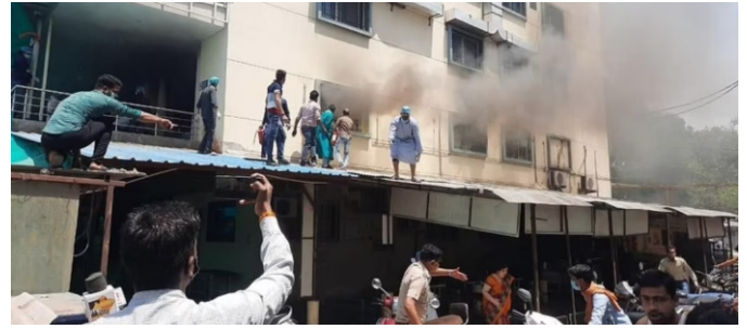
Patients try to jump from the burning floors of the Patidar Hospital, Ujjain, M.P.

9) On 4 th April, 2021, a major fire occurred at the COVID-19 ward of Patidar Hospital, Ujjain, Madhya Pradesh (See Fig. 14). Though no death was reported, about 80 patients were rescued from the hospital. The fire broke out due to a short-circuit in the power board of the ICU which is located at the first floor.