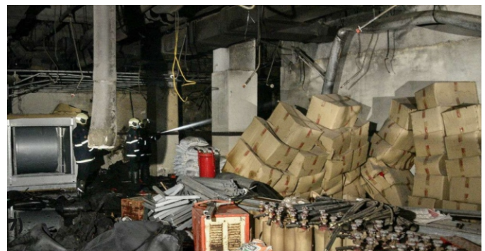
Fire fighters conduct rescue operations at ESIC Kamgar Hospital, Marol, Mumbai.

7) On 07 th December, 2018, a major fire broke out at ESIC Kamgar Hospital, Marol, Andheri, Mumbai (See Fig 05). Eleven persons died and over 176 were injured in this fire accident. A total of 147 people, including patients and visitors, were rescued after the fire broke out. The injured were shifted to nearby hospitals such as Cooper Hospital, Seven Hills Hospital, Holy Spirit Hospital, etc. Fire officials said the blaze started prima facie from the ground floor, where some rubber ducts were stored and spread upwards. Seven fire tenders and five jumbo water tankers were pressed into service to control the flames and the rescue operation continued till late evening. Some of the people trapped in the building jumped off the upper floors to save themselves and sustained injuries.