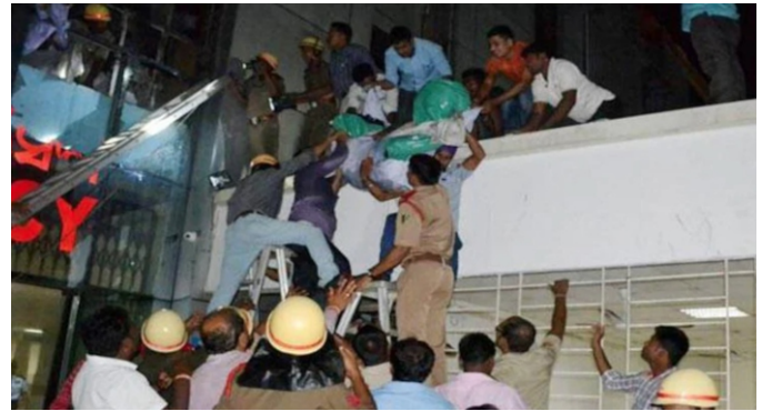
Injured being rescued from the IMS and SUM Hospital, Bhubaneswar.

premises, reportedly citing protocol, even pushing them back into the burning building, because they had not received orders from the Top Management to release the patients.